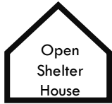
Open Shelter House