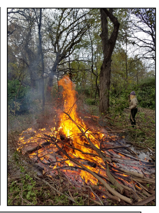
Pictured above are Jacob Solberg and Bailey Berger completing invasive species removal at Lake Iowa Park. Removing invasive species like autumn olive, honeysuckle, and redosier dogwood improve the health of the Oak Savanah forests in Lake Iowa. It can be a long process removing invasive species. First they have to cut the invasive species out, next the stumps or what is left in the ground must be treated with herbicide so it does not regrow, last they must burn the brush they had removed.