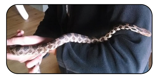
Foxy the Fox Snake