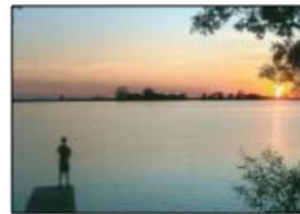
Sunset at West Twin Lake