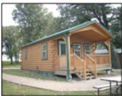
Crystal Lake Park Rental Log Cabins