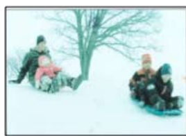
Sledding at Crystal Lake Park