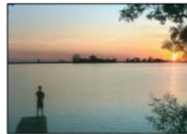
Sunset at West Twin Lake