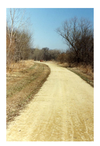
The trail head west toward the historic Hoy Bridge. Watch for the many song birds that make their homes along the trail as well as wild flowers growing there.