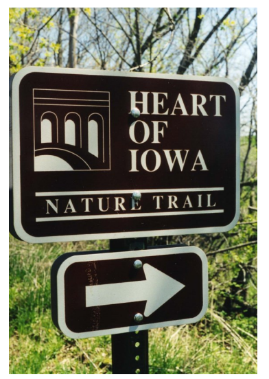
This sign is located at the trail head and parking on the south end of the Main Street of Rhodes.