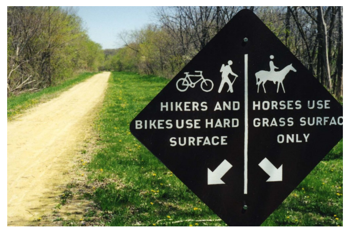
SUMMER: BICYCLING HIKING HORSEBACK RIDING

As you start on the 4.2 mile segment of completed trail from Rhodes into Story County, you will see this sign requesting horses to stay on the grassy area of the trail.