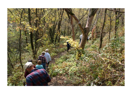
A foot path adjacent to the Trail leads to a viewing platform located below the Hoy Bridge.

As you start on the 4.2 mile segment of completed trail from Rhodes into Story County, you will see this sign requesting horses to stay on the grassy area of the trail.