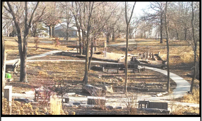
Nature Playscape at Lake Iowa Nature Center.

Come about late winter or early spring, we were chest-deep into writing grants. We worked with our Friends Foundation to obtain a canoe trailer to help expand our programming capabilities. Funding for a disc golf course at Lake Iowa was also secured. A grant for extra seasonal staff and supplies was