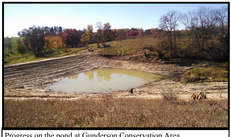
Progress on the pond at Gunderson Conservation Area.

Another grant that we finished in 2014 was the reconstruction of the front pond at the Gunderson Conservation Area. The dam of the pond was completely reconstructed further downstream, dramatically