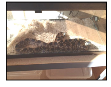
Thanks to everybody who participated in our snake-naming contest!