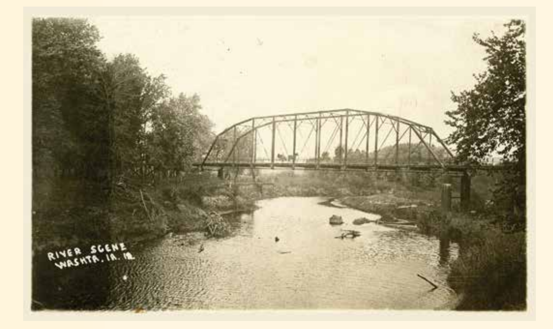
This postcard, postmarked in 1915, depicts one of a succession of bridges over the Little Sioux River at Washta. Bridges across the river were crucial for daily life and commerce and were often victims of floods and freshets (ice-outs in spring). As you paddle, you may come across remnants of past infrastructure that graced the Little Sioux in historic times.