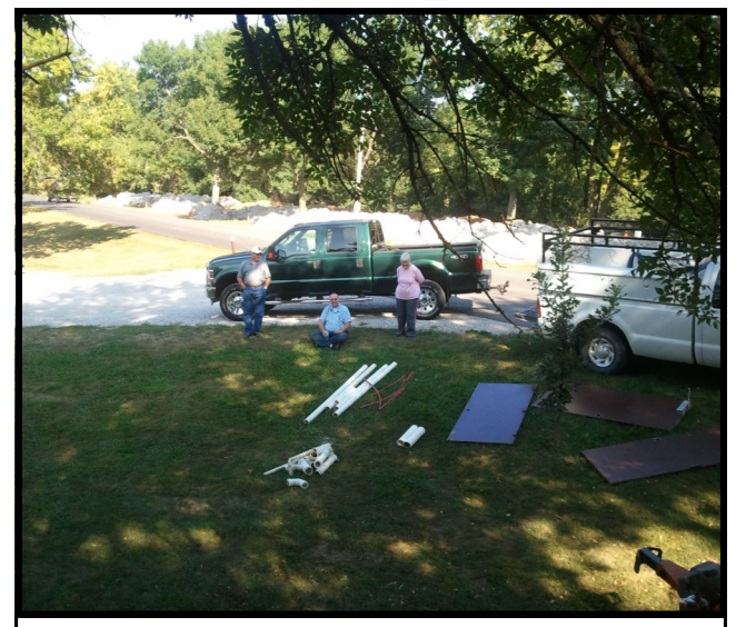
ICCB members and volunteers take a break from assisting with the tear-down of the old showerhouse.

To summarize what we are trying to say to these amazing people in our lives, we have to let you know that without you, there would be no education, conservation or recreation in Iowa County. We are thankful for your support and generosity, you truly are invaluable.