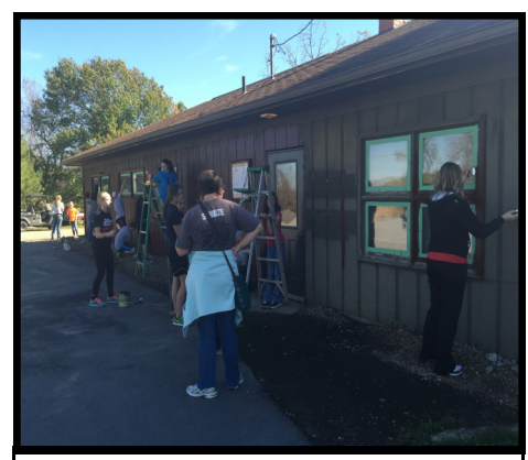
Williamsburg Jr. High volunteers at Lake Iowa helping out with various projects.

events like Iowa County Outdoor Adventure Day or projects such as building the bird blind done without volunteers. These volunteers are the citizens and groups who help us out and provide hours and monetary assistance. All of that does not go unnoticed, however, it may not get recognized, and for those volunteers we thank every one of you. The list of volunteers from our local communities is overwhelming and we appreciate every individual and group — the list is so long we can't fit it in the newsletter! For those of you constantly here by our side, offering assistance when able, or providing monetary support, we