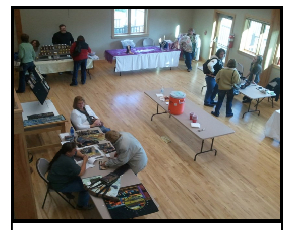
Fall Fest by Friends Foundation.

The second group of volunteers we need to acknowledge are those serving on the Iowa County Conservation Board (ICCB) and the Friends of Iowa County Conservation Foundation (Friends Foundation). These two boards may be ones you are familiar with; they make the events like the Memorial Day Weekend Breakfast, Friend's Banquet, and Outdoor Adventure Day happen. Those boards don't stop there; they make the world go 'round for the staff and make sure we are focusing on conservation, education and recreation. These groups ensure the bills get paid, programs are moving in the right direction, and that the staff is always pushing forward.