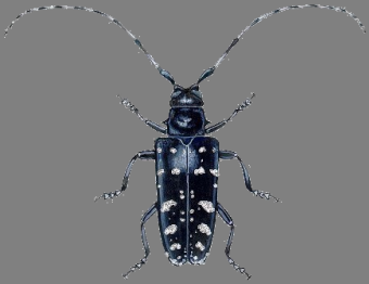
Asian Longhorned Beetle