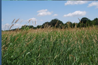
Reed Canary Grass